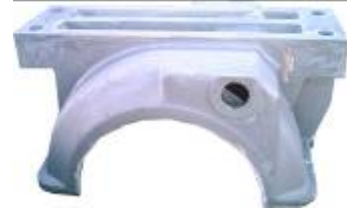
untill 3500 Kg