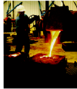
Iron foundry: GG 20-25-30 & GGG 40-50-60