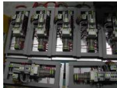
Automation control panel. Large deliveries and single equipments