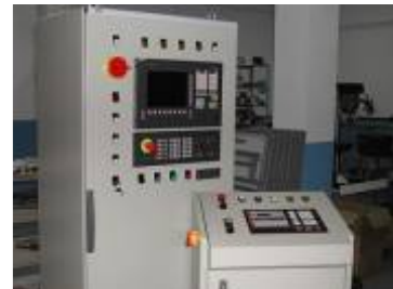
Control panel for Machine-Tool manufacturers